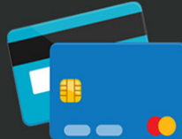
Credit Card Debt